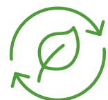
Simple and Green